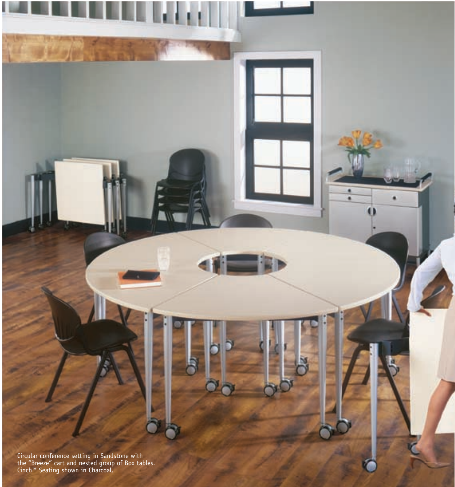
Circular conference setting in Sandstone with the "Breeze" cart and nested group of Box tables. Cinch™ Seating shown in Charcoal.