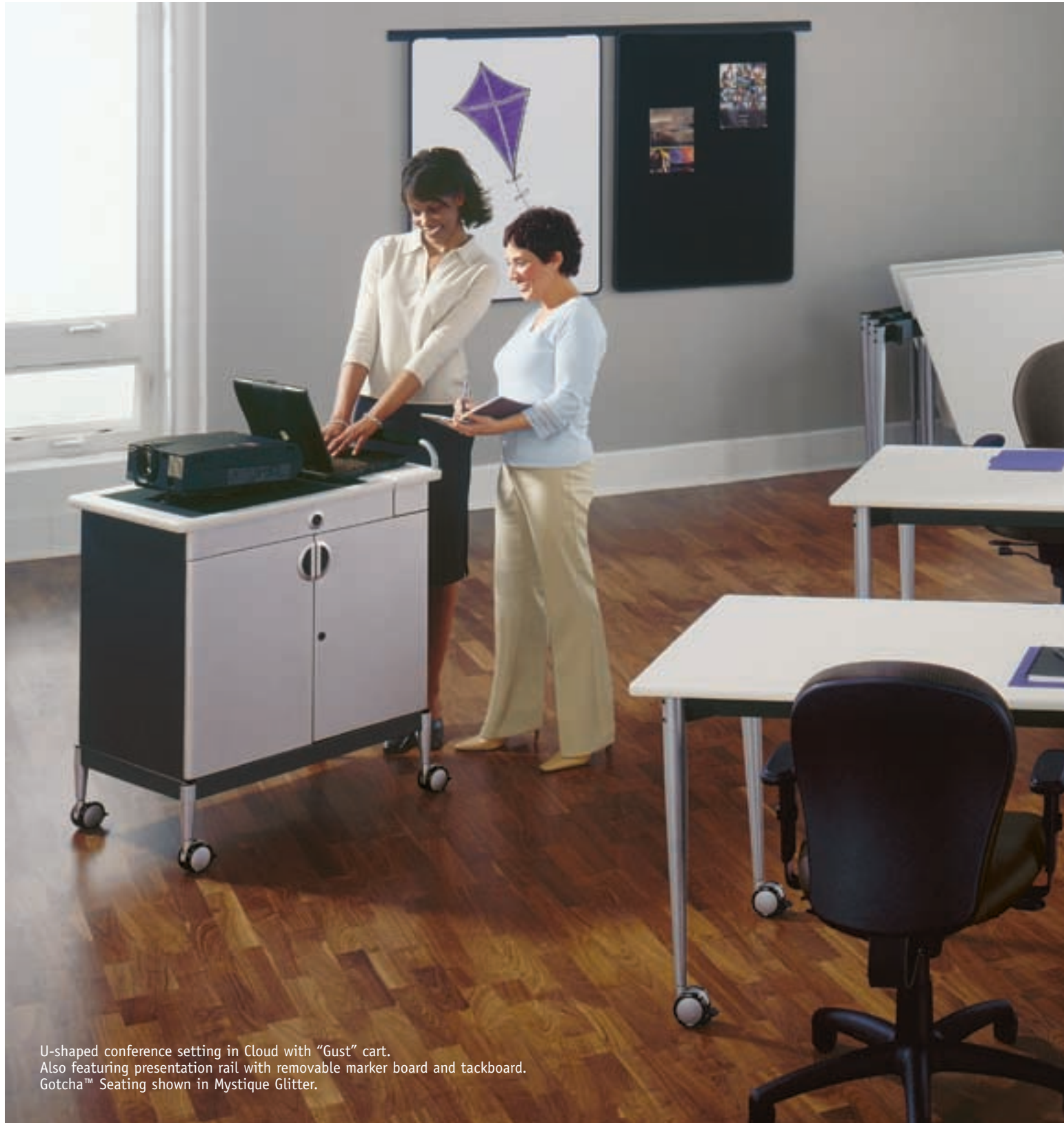
U-shaped conference setting in Cloud with "Gust" cart. Also featuring presentation rail with removable marker board and tackboard. Gotcha™ Seating shown in Mystique Glitter.